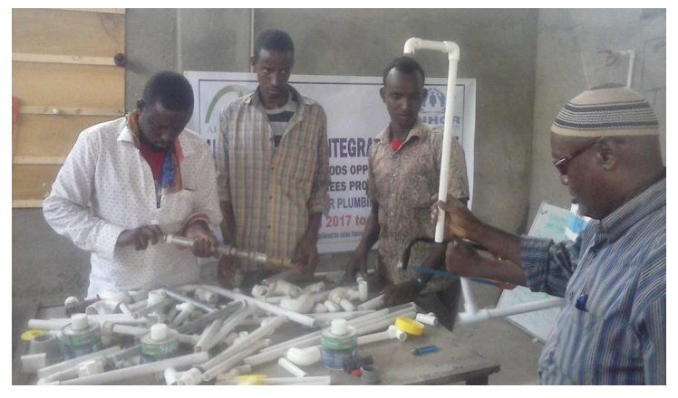
Returnees in a plumbing class in Kismayo.

In Kismayo, UNHCR completed technical and vocational training in construction, fabric dying, ICT, baking and tailoring for 100 beneficiaries (60 returnees, 20 IDPs and 20 members of the host community). Additionally, 80 beneficiaries (48 returnees, 16 IDPs and 16 host community) were trained in fish preservation.