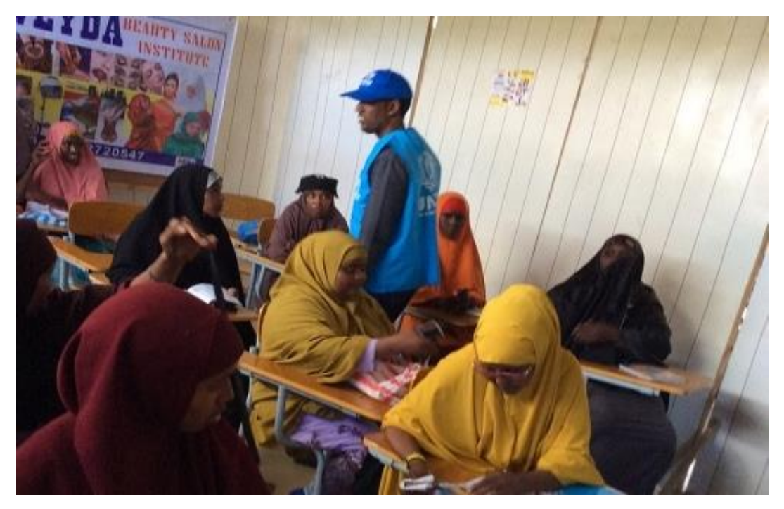
Returnees in the beauty salon class in Mogadishu. © UNHCR / June, 2017

In Mogadishu, 160 beneficiaries (127 returnees and 33 IDPs) began technical and vocational training in ICT, tailoring, beauty therapy, catering, mobile repair, handicrafts and mechanics.