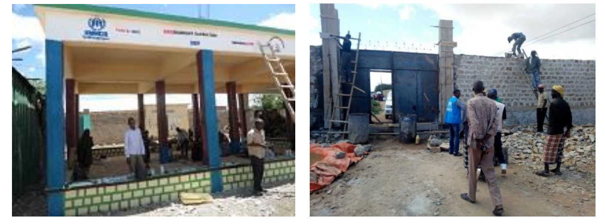
Finalization of the rehabilitation of a market [left] and a Mother Child Hospital [right] in Baidoa.

In Baidoa, UNHCR completed the rehabilitation of a Mother Child Hospital (MCH) and the rehabilitation of a market through a cash for work programme. A total of 217 beneficiaries (148 returnees, 40 IDPs and 29 members of the host community) were part of a programme.