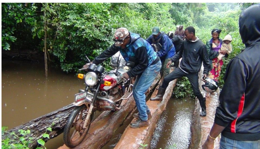
Makeshift bridge between Yakoma and Ndu. Only motorbike can cross.

Presence of elements belonging to armed militias “Seleka” and “Anti Balaka” from Central African Republic was reported in Zapay (Ango territory, Bas-Uele province). This area is already affected by the presence of LRA (Lord Resistance Army) militiamen. Therefore, Congolese military authorities called the population to evacuate the area. CNR is exploring the possibilities of supporting relocation of the most vulnerable. Around 4,000 asylum-seekers are in the area.