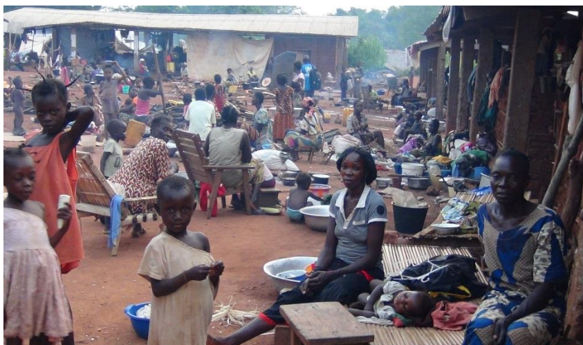
New arrivals from CAR hosted in a school in the town of Ndu