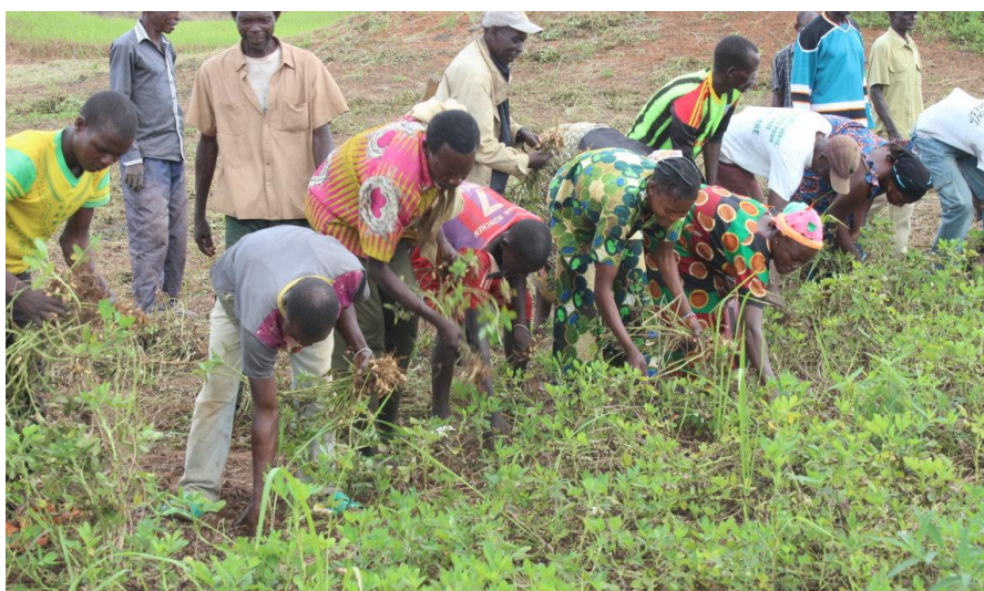
Peanuts harvesting in Inke camp