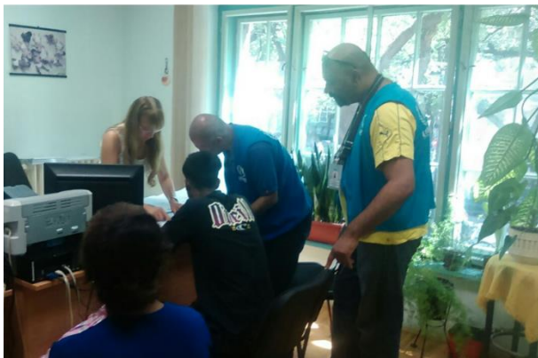
UNHCR partners organise marriage and birth registration for an Afghan refugee man and Iraqi refugee woman and their new newborn baby, Subotica (Serbia), 21 August 2017

They are mainly from Afghanistan, followed by Iraq, Pakistan, and Syria. More than half are children, including approx. 130 UASC.