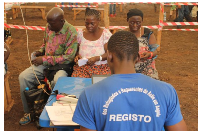
Registration of a refugee family at the new Lóvua settlement.