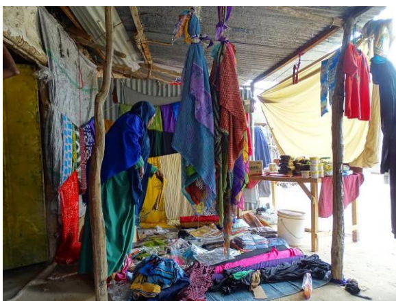
Fatima's family established a kiosk in Lower Juba region after they returned to Somalia

Fatima ( not her real name ), a mother of nine received an enhanced return package after she returned to Somalia in January 2017 and established a kiosk.