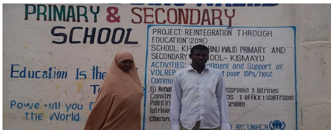
Returnee students at the school in Lower Juba region.

In the beginning of the year Ahmed and Aisha ( not their real names ), now both students of the Khalid-bin Walid school in Lower Juba, benefited from the education grants component of the enhanced return package.