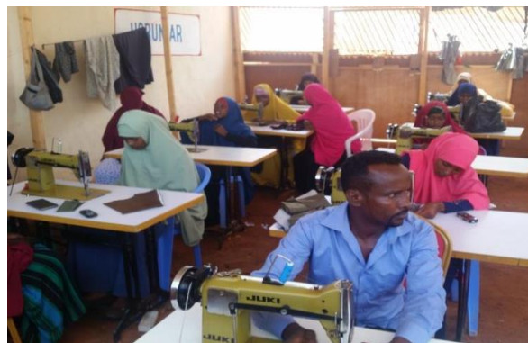
Somali returnees in tailoring class in Lower Juba region.

Out of 1,010 beneficiaries of technical and vocational trainings 110 have graduated. They obtained skills on fish preservation, construction, fabric dying, information technology, baking, tailoring, and air conditioner and refrigerator repair.