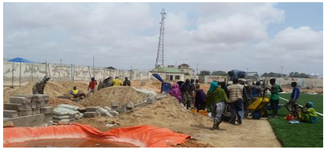
Building an athlete running track. © UNHCR / Lower Juba region, August 2017