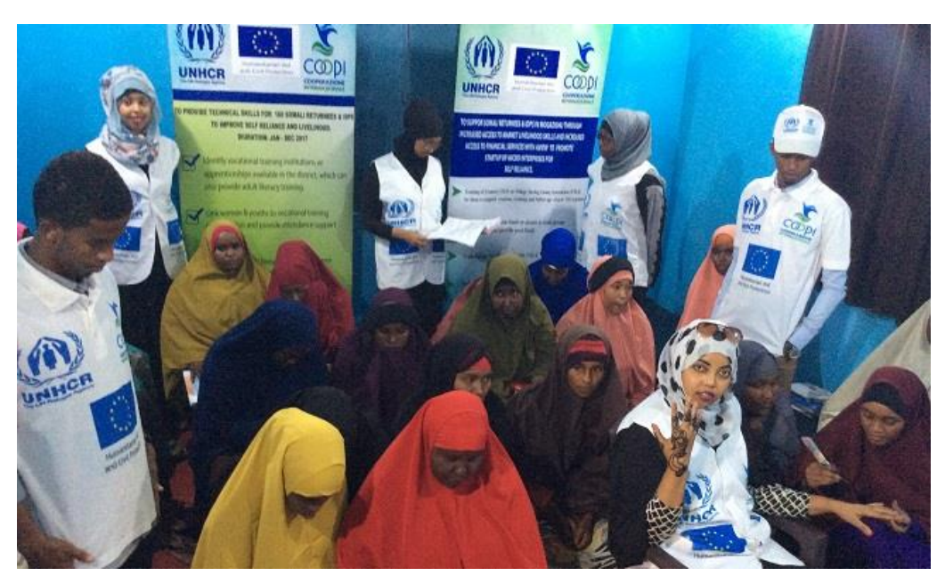
Students of a beauty salon class showing their skills to draw a henna to UNHCR partner during a monitoring visit. Banadir region, August 2017

In Bay region, 450 beneficiaries (110 returnees, 100 IDPs and 240 members of the host community) harvested crops supported by UNHCR agricultural project earlier in