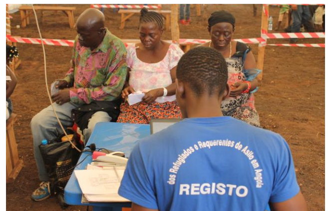
Registration of a refugee family at the new Lóvua settlement.