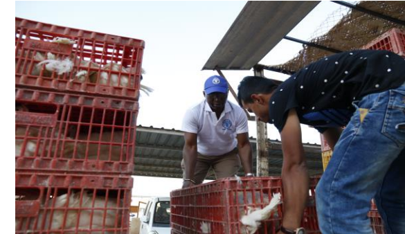
Syrian refugees families and members of impacted host community receive laying hens in Khabat district , Erbil, KR-I, FAO/Iraq

In non-camp areas: to reduce long-term dependence on emergency food assistance and enable people to recover as quickly as possible, FAO has assisted 1,440 persons (Syrian Refugees and members of impacted host community (720 persons in Khabat area in Erbil and 720 persons in Amadia area in Duhok). The assistance included: 5,760 hens (23 hens/family), drinking equipment and 48 metric tons of poultry feeding. This assistance will provide meat (30 Kg/family/year), eggs and incomes from the sale of surplus eggs.