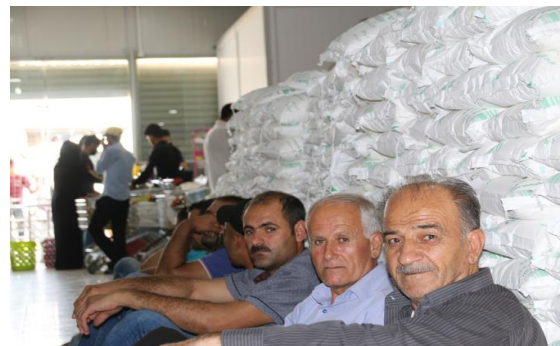
Syrian men wait by the checkout tills in Darashakran refugee camp.