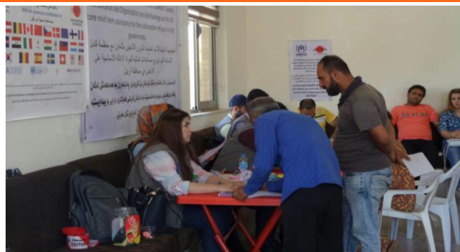
Cash for CRI distribution for the vulnerable new arrival Syrian Refugees, July 2017