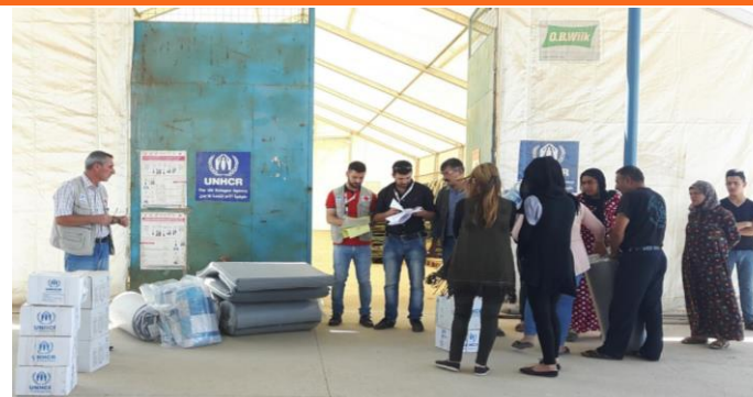
NFI/CRI distribution for new arrival cases in Domiz1 refugee camp, Duhok.