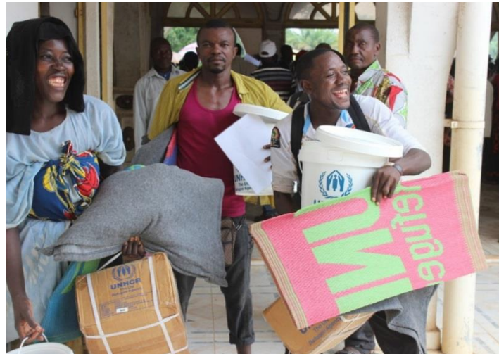
Newly arrived refugees received relief items in Yakoma

New clashes fighting and attacks by armed groups in some localities of Central African Republic situated at the border with DRC (Gambo, Bema, Satema) pushed civilians to cross the river and to flee into DRC.