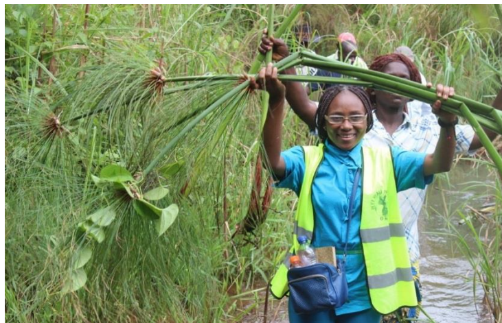
Training on papyrus harvesting in the framework of the project « Dignite pour les femmes »