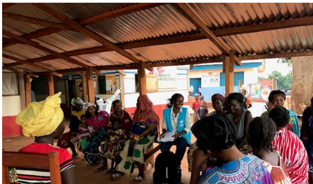
UNHCR Staff conduct focus group discussions at the Hospital IDP site in Bria. Photo: Jonathan Sena Torres / UNHCR / 9 August 2017