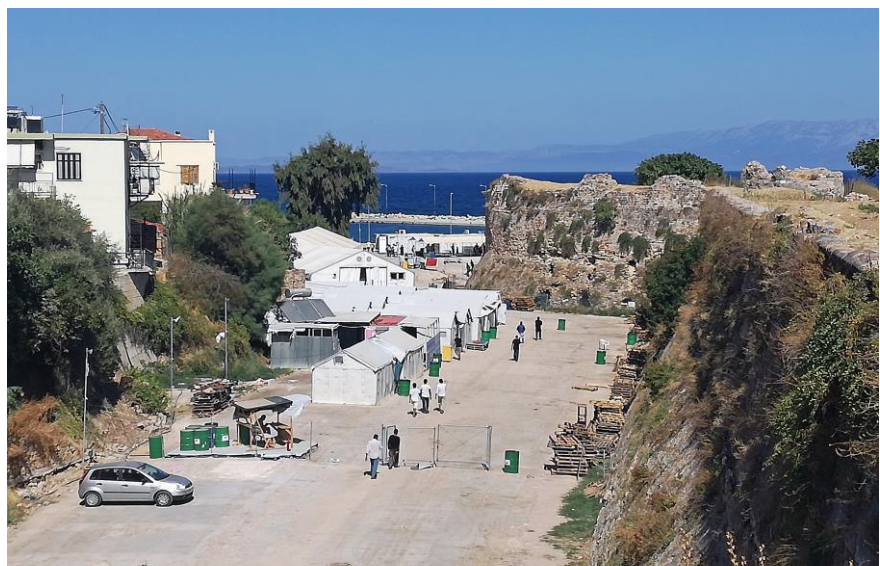
UNHCR supported continuing efforts of Chios Municipality to responsibly close the Souda site.

1 Islands Unit in Athens 1 Sub Office on Lesvos 5 Field Offices on Chios, Samos, Kos, Leros and Rhodes