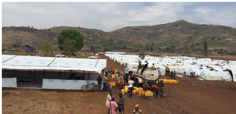
Temporary site opened in Kamanyola to host 2485 Burundian refugees and asylum seekers outside the MONUSCO COB after the incident of 15 September.