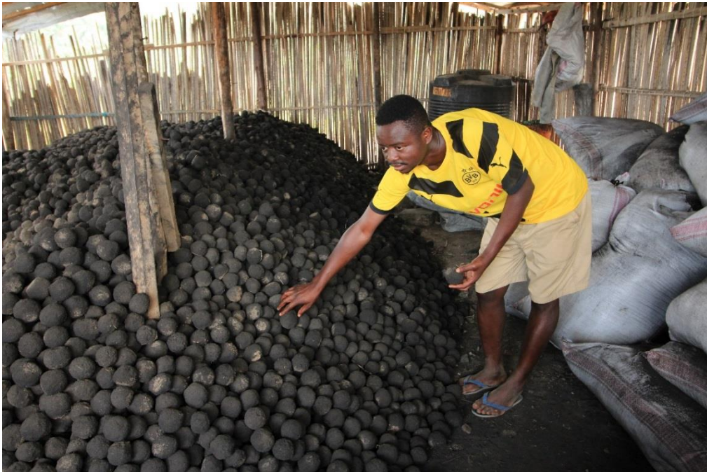
A refugee in charge of the production of briquettes in Lusenda camp shows the stock of his workshop.