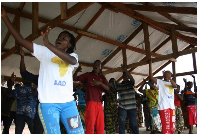
Dance classes - Refugees on the move project in Inke camp