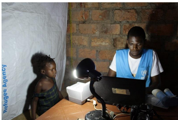
Biometric registration in Kambo, Nord Ubangi

Conditions of new arrivals are extremely precarious: there is lack of shelter and core relief items, drinking water, food, sanitation and healthcare. They arrived with few belongings, and often their houses and property have been burned down or looted. Some of them are working in the fields of host community for little money or some food.