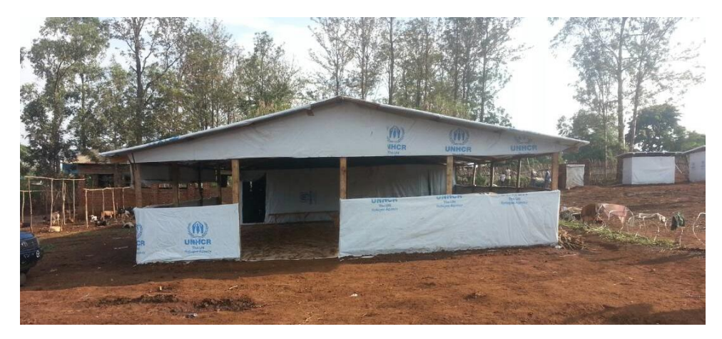
The registration hagar fully rehabilitated after the storm in Kamanyola.