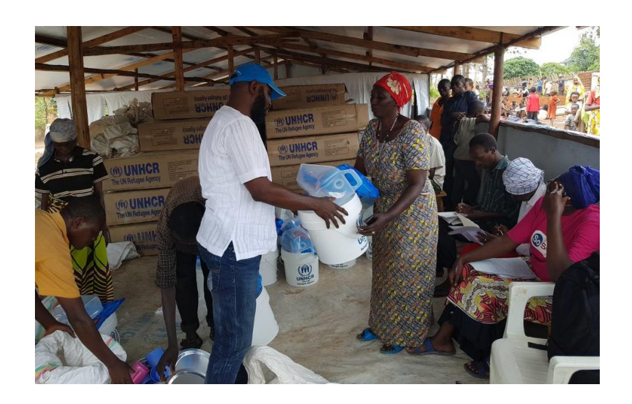
NFI distribution at Kamanyola site, October 2017

For this operation, partners financed by the UNHCR are: AIRD, CNR, ADES, INTERSOS and SAVE THE CHILDREN. Other partners working with their own funds include ADED, AFPDE, BVES, EBEN EZER, CARITAS, GEADES. FAO, ICRC, OCHA, PAX CHRISTI, RHA, UNFPA, WAR CHILD HOLLAND, WFP, WHO, SVH and WORLD VISION.