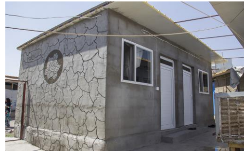
Shelter upgrade (self-construction* ) in Gawilan Camp.

• Quick Impact Projects or Community Support Projects: So far, four projects out of 14 projects (six health, three WASH, three education and one community-based project) completed and the remaining are under implementation to which the shelter sector has provided technical support and has monitored the implementation.