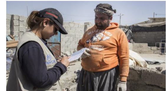
Shelter upgrade (self-construction* ) in Gawilan Camp.