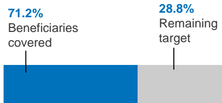
Refugees who received core relief items