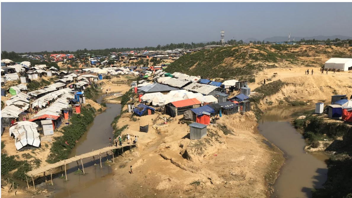
After the initial Rohingya displacement, many shelters were built on low land and will be vulnerable to flooding.

A Joint Response Plan, covering the period from March to December 2018, is under preparation