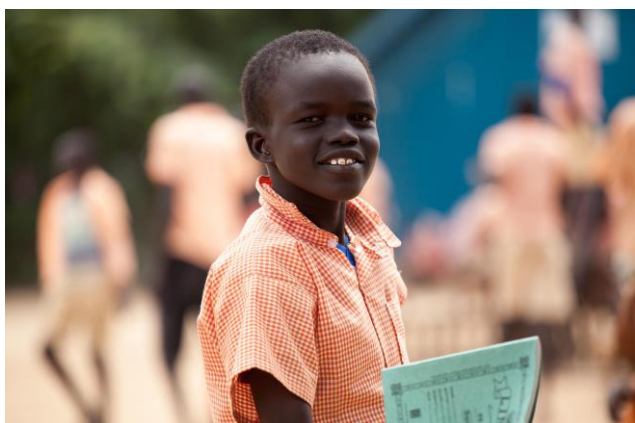
South Sudanese boy smiles as he walks to his new class. All 24 Primary schools in Kakuma and Kalobeyei have resumed learning after the long December holidays.

The above figures show the overall refugee population registered in the UNHCR database as at 21 January 2018. The figure is inclusive of the refugee population hosted at Kalobeyei Integrated Settlement.