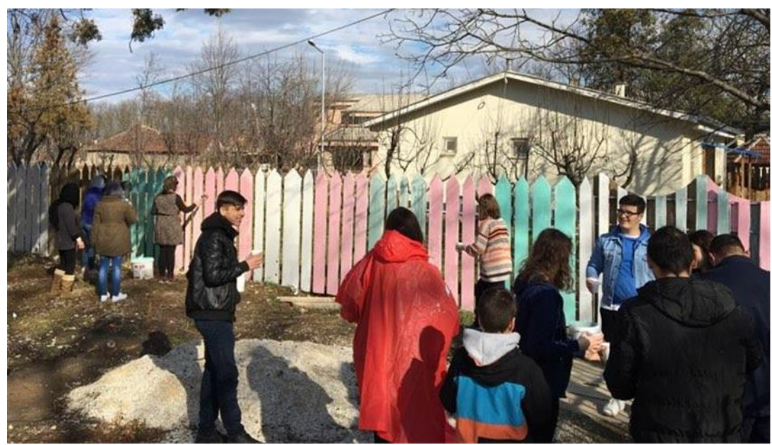
Refugee and local youth from Presevo painting the fence at the Presevo Reception Centre as part of a community based project, Presevo (Serbia) @UNHCR, 15 February 2018