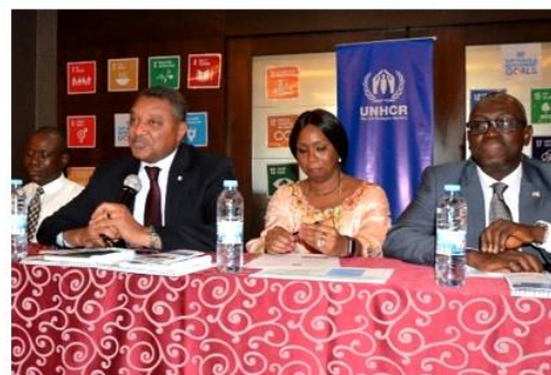
COP 2018-2019 high-level consultation meeting in Monrovia on 1 March 2018.