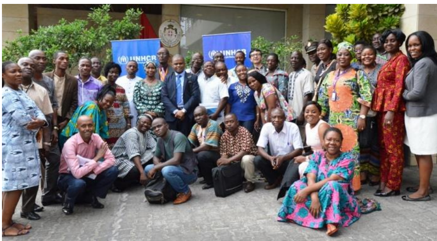
Participants of the COP 2018-2019 consultation meeting in Monrovia on 21 February 2018