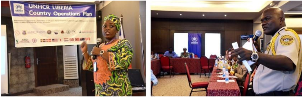
COP 2018-2019 consultation meeting participants' presentations in Monrovia on 21 February 2018