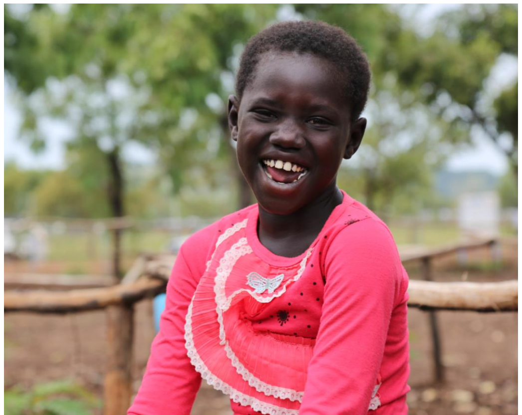
All smiles- a South Sudanese girl at the Child Friendly Space in Nguenyyiel camp.