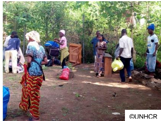
1,738 refugees benefitted from the distribution.