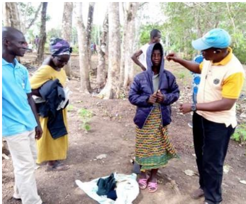
A PSN refugee receives a coat.