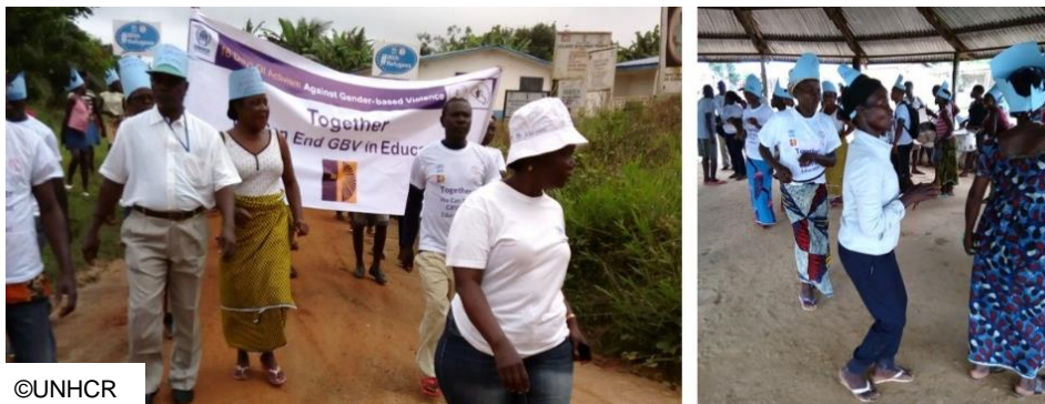
Celebration of 16 Days of Activism Campaign Against Gender Violence in Maryland.