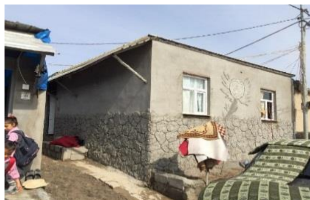
Upgrading shelter in Domiz 1 camp

Out of camps, 90% of households in the KR-I host community were renting house or apartments. Provision of adequate and targeted shelter support to refugees residing out of camps requires increased attention as needs remain very high.