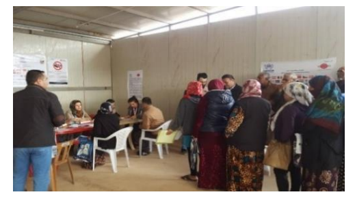
CASH distribution by Qandil, 2017, Kawergosk camp, Erbil, Kurdistan region-Iraq.

In Duhok, 1,297 complaints were lodged in the Domiz-1 Camp box, majority of which were related to food and CRIs assistance. The received complaints were directed to the relevant organizations for follow up. The families were visited, provided with counselling and referred to appropriate service providers.