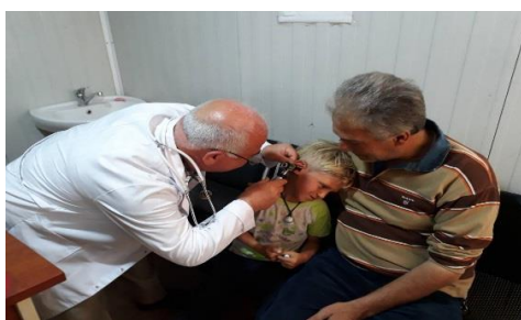
A medical doctor is providing medical consultation, Qushtapa camp, Erbil