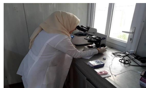
Laboratory services, Qushtapa camp, Erbil