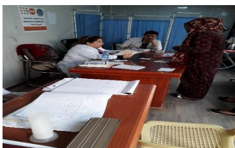
Ante- Natal-Care (ANC) services, Qushtapa camp, Erbil