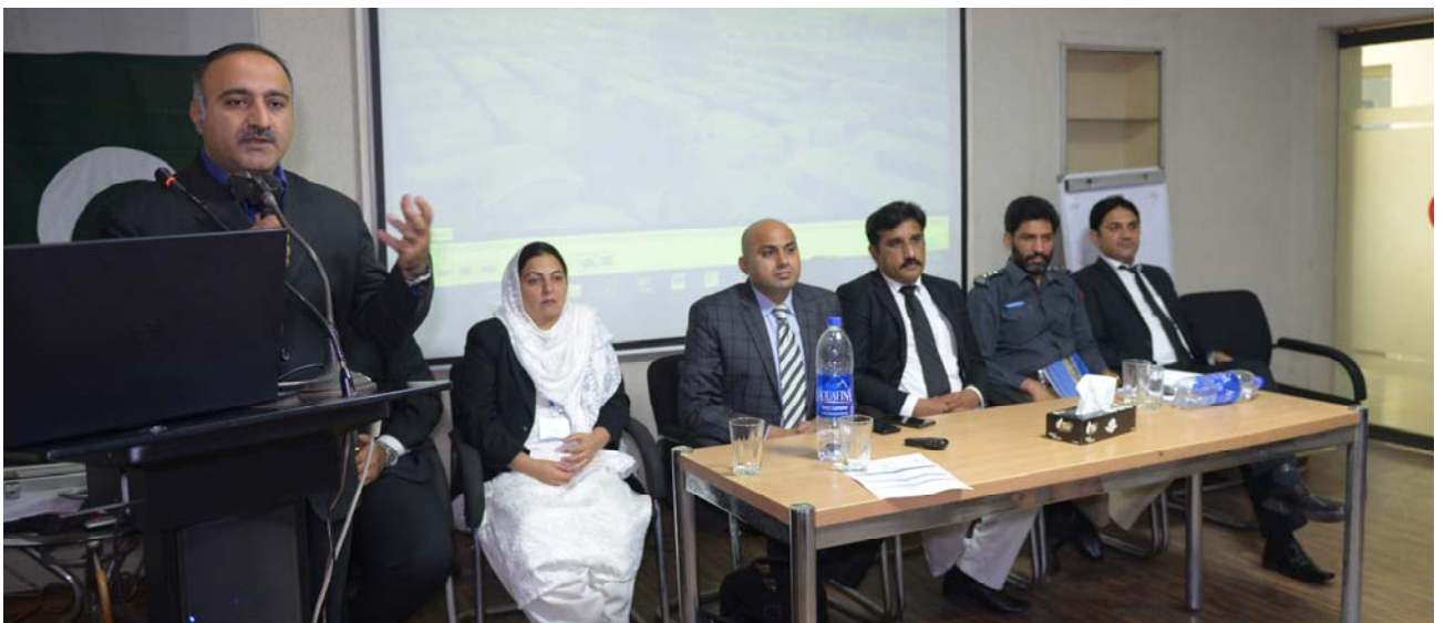
Training for Police officials by SHARP and UNHCR, Lahore, Pakistan