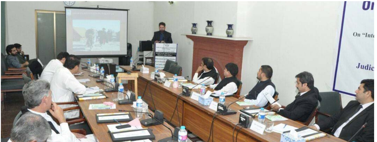
Training for judges by UNHCR, Judicial Academy Peshawar, Pakistan

UNHCR and ALAC staff organised a total of 127 legal outreach and shura meetings reaching 2,841 participants (45 per cent of whom were women) during the March-April period. 65 per cent of the legal sessions were held in refugee villages and the remaining sessions in urban areas of Pakistan. Through these legal sessions, refugees shared various issues affecting their communities. UNHCR partner staff informed refugees of the availability of free legal aid and UNHCR helpline services. In April, UNHCR held meetings with district and provincial authorities on the relocation of Ichrian and Bareri refugee villages to Khaki refugee village in Mansehra/KP. UNHCR will continue to work with authorities to find viable alternatives for the refugees affected by the relocation.