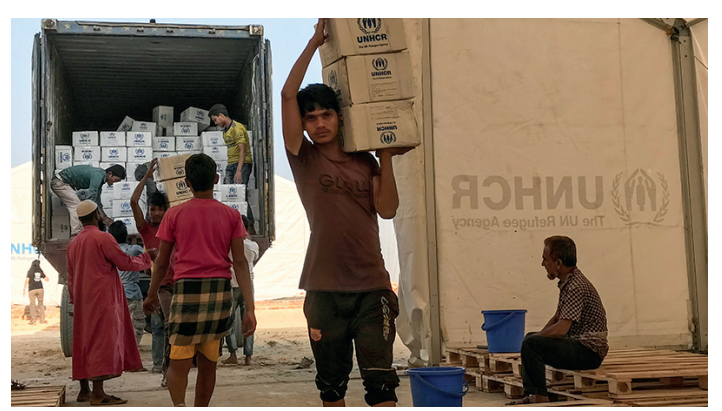
Kitchen sets being unloaded into the new UNHCR warehouse in Cox's Bazar.

In September 2017, when an average of 16,000 refugees were fleeing into Bangladesh every day, UNHCR urgently began airlifts to deliver much needed aid. In less than three months, as many as 17 airlifts carried 1,671 tents, 2,405 tarpaulins, 55,511 kitchen sets, 142,938 blankets, 57,300 jerry cans, 62,100 mosquito nets, 177,675 sleeping mats, 28,760 buckets, 11 prefabricated warehouses and 58,120 solar lamps to Bangladesh. The storage capacity of UNHCR's warehouse in Cox's Bazar is 6,000 cubic meters (2,480 square meters), which is enough to assist up to 165,000 individuals at a time. So far in 2018, UNHCR had four airlifts which carried over 4,320 of tents, in addition to core relief items (CRIs).