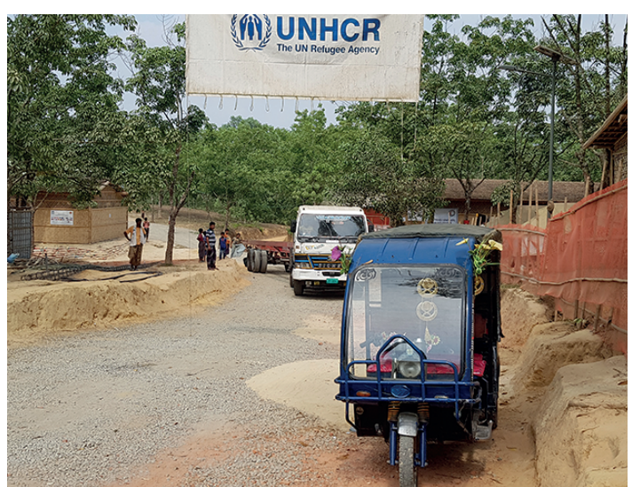
The Transit Centre in Kutupalong, where newly arrived refugees can access life-saving assistance prior to their relocation to Kutupalong settlement.

In the Transit Center, UNHCR works with the following partners: Refugee Relief and Repatriation Commission (RRRC), UNHCR, Action Contre la Faim (ACF), Bangladesh Red Crescent Society (BDRCS), Handicap International (HI), International Committee of the Red Cross (ICRC), International Federation of the Red Cross (IFRC), International Organization for Migration (IOM), Médecins Sans Frontières (MSF), Oxfam, Save the Children (SCI), Technical Assistance International (TAI) Turkish Cooperation and Coordination Agency (TIKA).