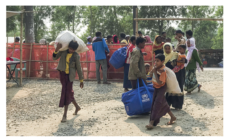
Newly arrived refugees at the Transit Centre in Kutupalong.

The Rubber Plantation Transit Centre (TC) in Kutupalong was established to temporarily receive newly arrived refugees in urgent need of life-saving assistance pending their relocation to the Kutupalong settlement. The site was designed in a way to limit the impact on the environment, with the minimum number of trees being cut within the rubber plantation. The trees provide some shaded areas to protect refugees from the sun, and for some space between the tents and shelters.