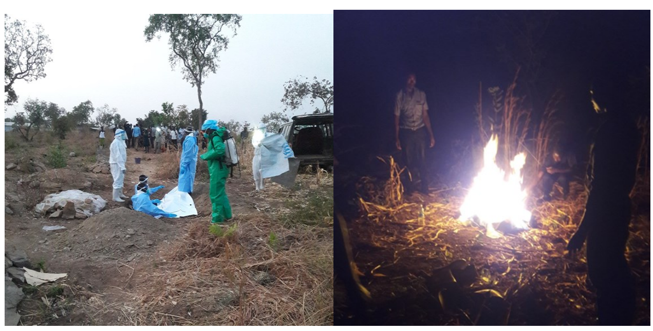
@Supervised burial of a suspected VHF case by Arua EPR team, Tyete, Bidibidi

One suspected case of VHF in lyete HC III, Standard Precautions were observed; Results received from UVRI on 22<sup>nd</sup> January 2018 ruled out VHF.