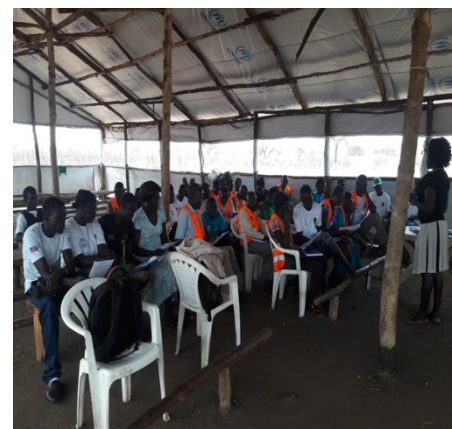
RVF Training for Health workers by Regional EPR Team RVF Training for VHTs in Bidibidi Refugee settlement (Ariwa, Zone 5)