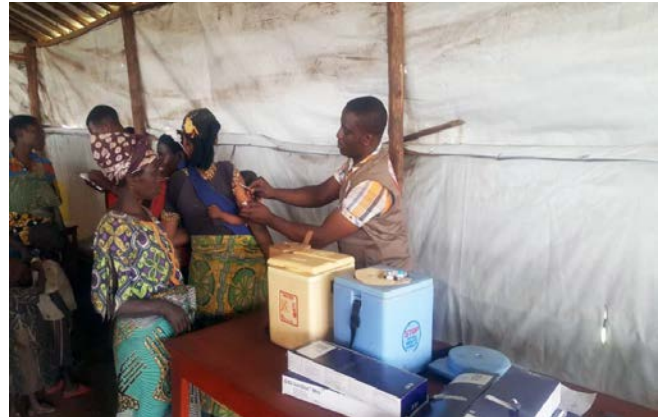
New arrivals receive measles and polio vaccination at Nyakabande transit centre, Uganda.