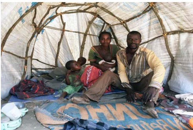
A Congolese family inside their makeshift shelter in Kyangwali's Malembo C, Uganda.