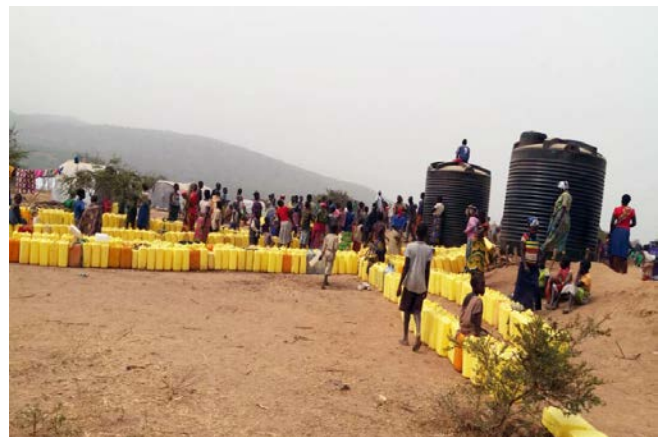
New arrivals wait for the arrival of water trucks at a water collection point in Kyangwali's Malembo C, Uganda.