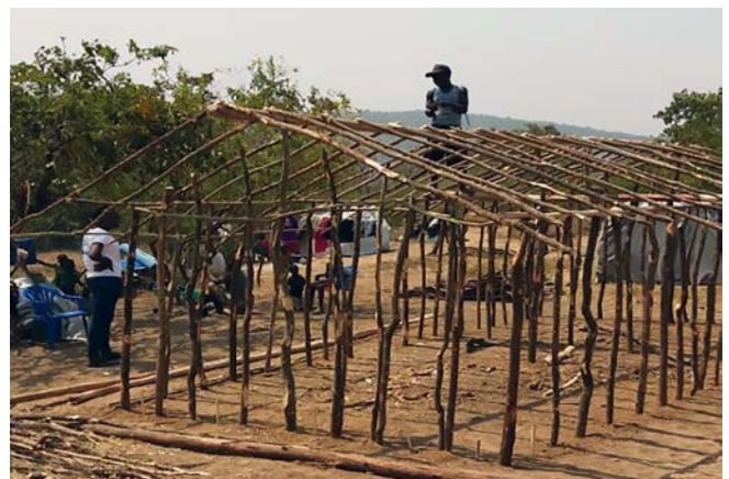
A Congolese new arrival builds his own shelter in Kyangwali's Malembo C, Uganda.