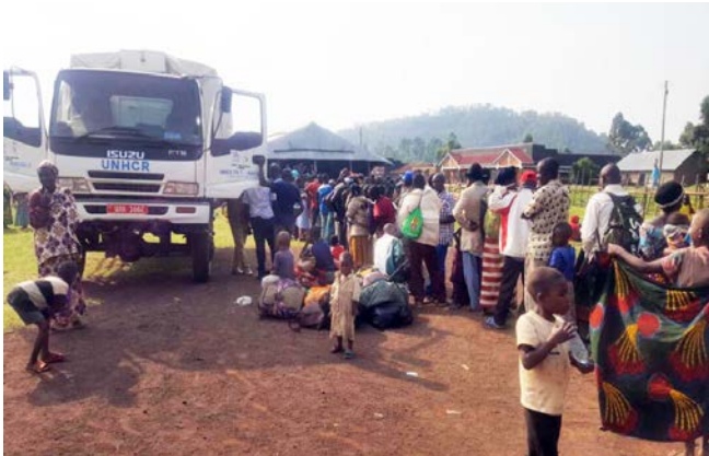
New arrivals line up for registration at Nyakabande transite centre, Uganda.