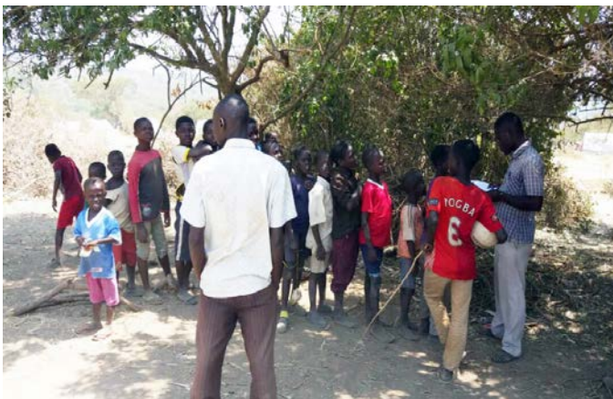
Aid workers register unaccompanied minors and separated children in Kyangwali's Malembo C, Uganda.