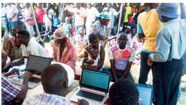
Congolese new arrivals undergo biometric registration in Kyaka II settlement, Uganda.