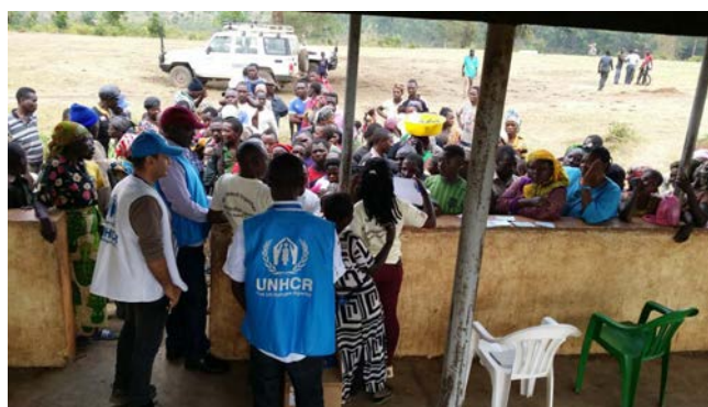
Congolese refugees receive solar lamps from UNHCR in Kyaka II settlement, Uganda.