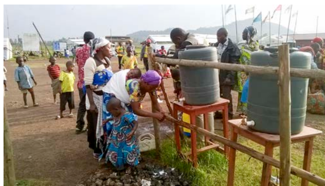
Congolese refugees go through washing facilities upon arrival at Nyakabande transit centre, Uganda.