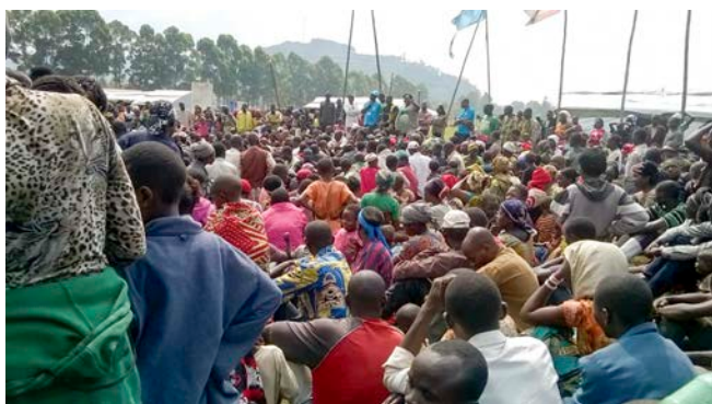
UNHCR staff brief Congolese new arrivals at Nyakabande transit centre about relocation procedures to Kyaka II settlement, Uganda.