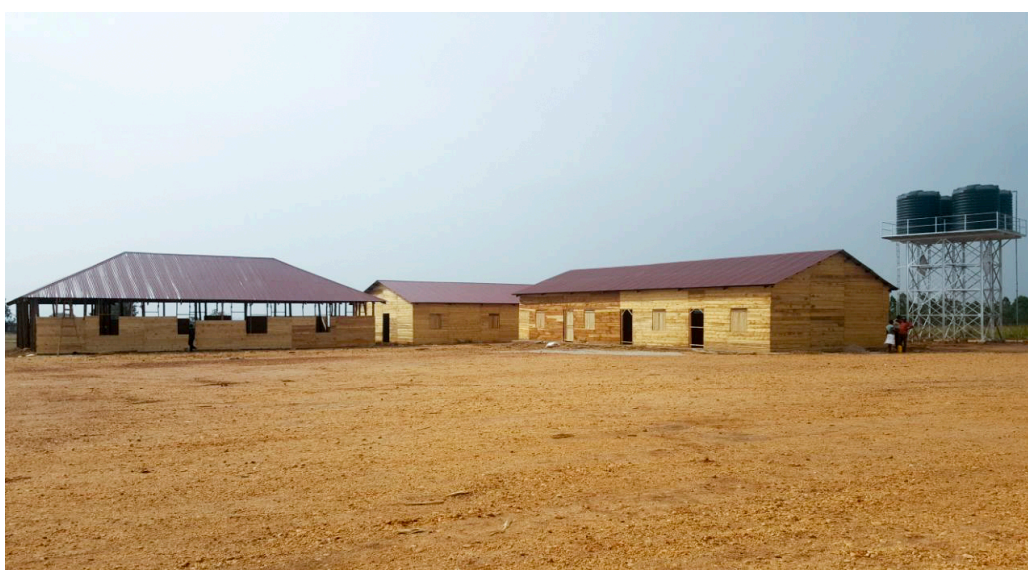
Matanda transit centre under construction, Uganda's Bundibugyo district.