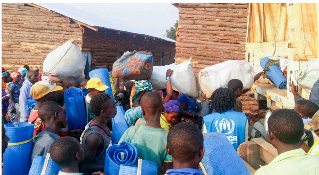
Congolese new arrivals load board trucks at Kyaka II for relocation and settlement at Byabakora, Uganda.