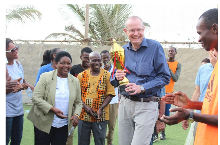
Football match between UNHCR staff, the German Embassy and OFADEC against DAFI students on 2 December 2017 during the DAFI scholarship celebration. The German Ambassador giving the cup to the DAFI team.