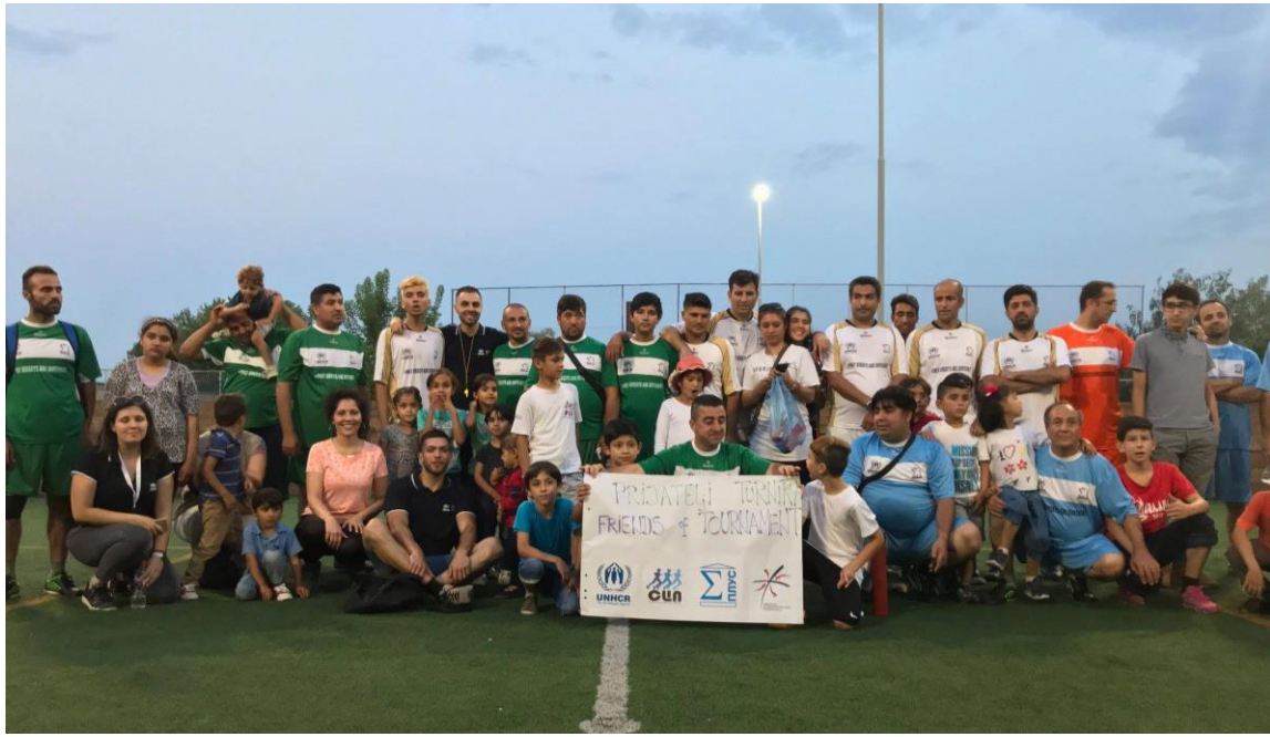
Football tournament "Only jerseys are different", Pirot, Serbia @Sigma Plus, 13 July