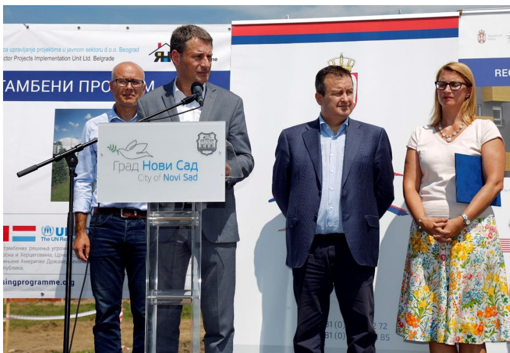
RHP event in Novi Sad, 07 August 2018