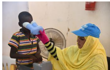
UNHCR continues to register Malian refugees through the BIMS system

In order to strength and build adequate referral pathways, advocate for inclusion of refugees in all national protection mechanisms UNHCR is meeting with partners in order to bring refugee issues in key child protection ongoing discussions.