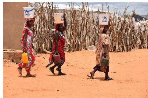
Refugee women bring home water from the water point in Mbera camp

During the reporting period, UNHCR continued with routine monitoring and network management activities to make the water system in Mbera camp more efficient. These maintenance works included the change of 10 taps in all camp areas, the repair of 5 faucets, the change of two valves to reduce water loss, the clogging of 4 leaks, and the maintenance of meters.