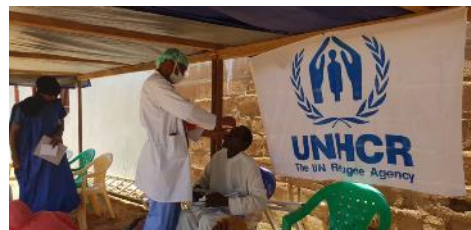
A doctor of the medical caravan taking care of a Malian refugee

UNHCR referred 24 patients from Mbera camp to Kiffa, Nema and Nouakchott hospitals. Fifteen refugees were provided cash support to cover medical needs. UNHCR and its partner, the Lutheran World Federation (LWF) ensure medical evacuations for secondary and tertiary medical cases of refugees and host community patients who cannot be treated in the camp or in Bassikounou. In addition, 308 urban refugees received health assistance including check-ups, medical visits and surgeries.