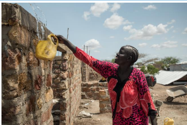
A refugee woman involved in water curing of her house in Kalobeyei settlement. UNHCR has rolled out the first cycle of CBI for shelter in which 200 refugee families have started the construction of their permanent homes.