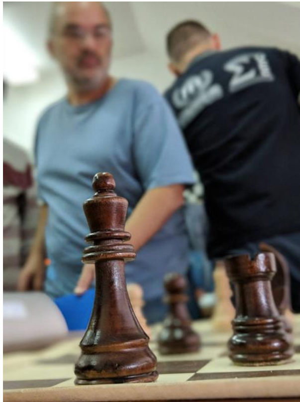
Refugees, migrants and local citizens met in Pirot to play chess