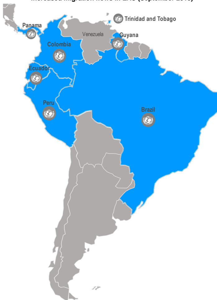
Map 1: UNICEF Country Offices with active response to the increased migration flows in LAC (September 2018)

This map is stylized and not to scale. It does not reflect a position by UNICEF on the legal status of any country or area or the delimitation of any frontiers.