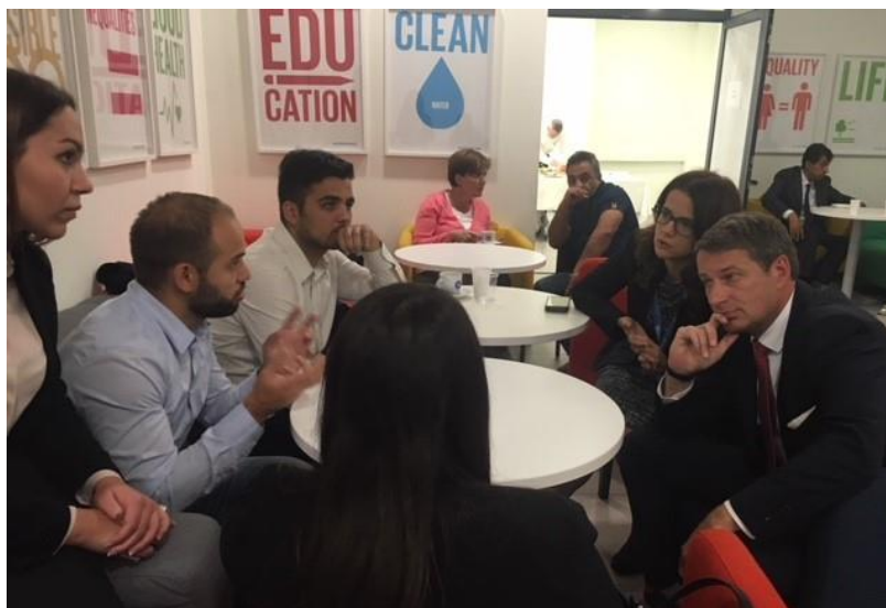
Consulting Roma youth activists on inclusion projects, © UNHCR, Belgrade 29 Oct 18