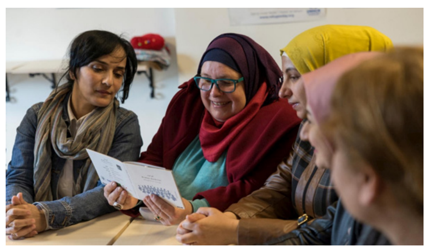
Women's solidarity group in Istanbul

which identified women working on the streets of Ankara, who are at heightened risk of SGBV due to their vulnerable socio-economic status. This included female heads of households, as well as families with one or more specific protection needs identified within the household. The women identified are supported through multi-sectoral interventions, including Turkish language classes, daily incentives to enrol children in child-friendly spaces, and enrolment in vocational courses. Ensuring self-reliance for women reduces their vulnerability to SGBV and enhances their prospects for integration.