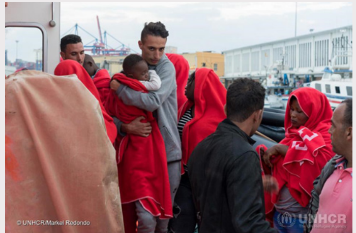
Spain. Rescue ship docks in Malaga with refugees and migrants

goating refugees and migrants for political gain is not.” UNHCR and IOM urged European leaders to focus on the practical solutions that are urgently needed and ensuring responsibilities are properly being shared among European States.