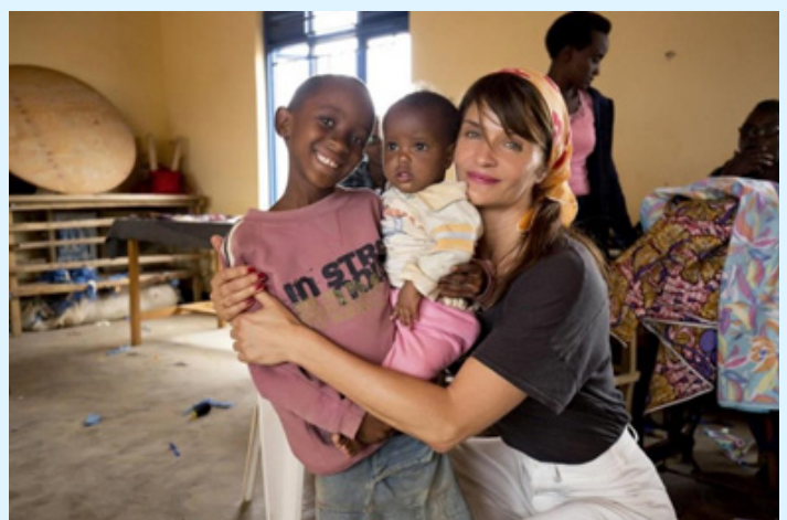
UNHCR High profile supporter, model and photographer Helena Christensen, who travelled to refugee camps in Rwanda with UNHCR, called for urgent funding and global attention to refugees.

or regional levels. This is according to a report released by UNHCR, the UN Refugee Agency.