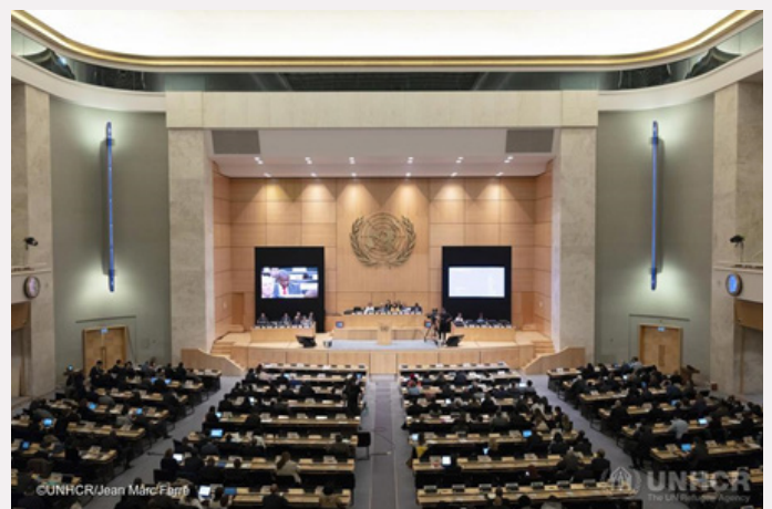
Members of the Excom, and invited delegates, gather for the 69th session of UNHCR's Executive Committee in Geneva

Based in law and rooted in respect for humanity, they provide a vanguard against chaos and anarchy, and a healthy check on unhealthy dynamics of power. Despite our daily despair, let us not forget the progress we have made and honour the many, often unsung achievements.” said Volker Türk, Assistant High Commissioner for Protection addressing the Executive Committee.