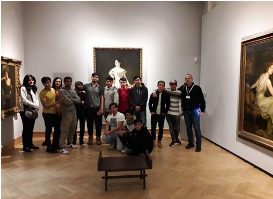
Unaccompanied and Separated Children from Krnjaca AC visiting Museum, Belgrade, 04 December 2018