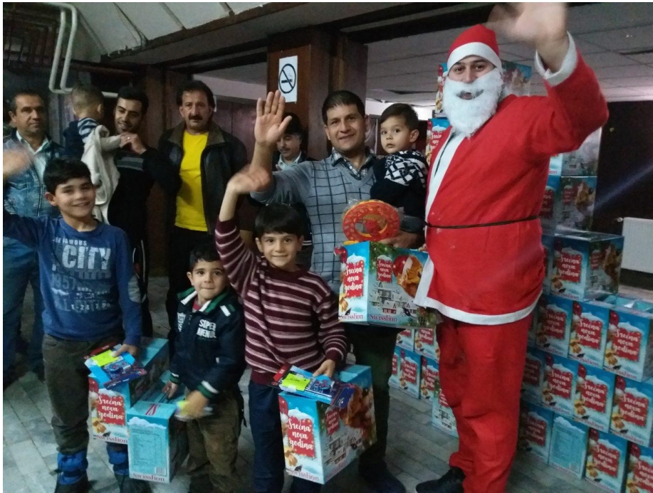
New Year's gift distribution to refugee children in the Reception Centre Vranje, Vranje, Serbia ©UNHCR, 18 December 2018