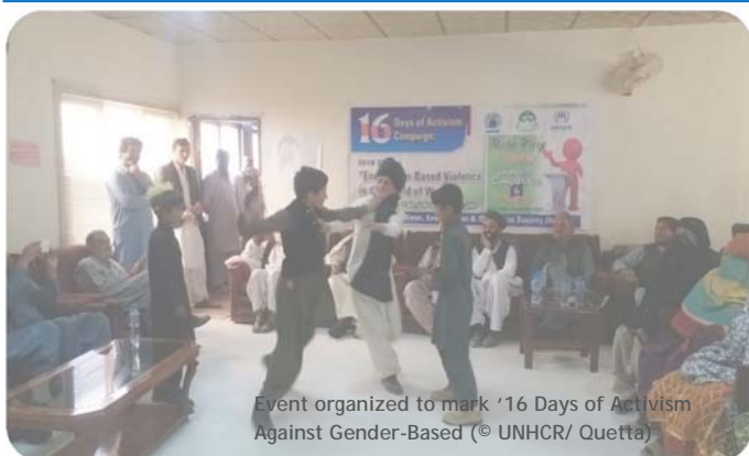
Event organized to mark '16 Days of Activism Against Gender-Based Violence'