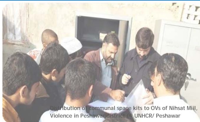
Distribution of communal space kits to OVs of Nihlat Miil, Violence in Peshawar district