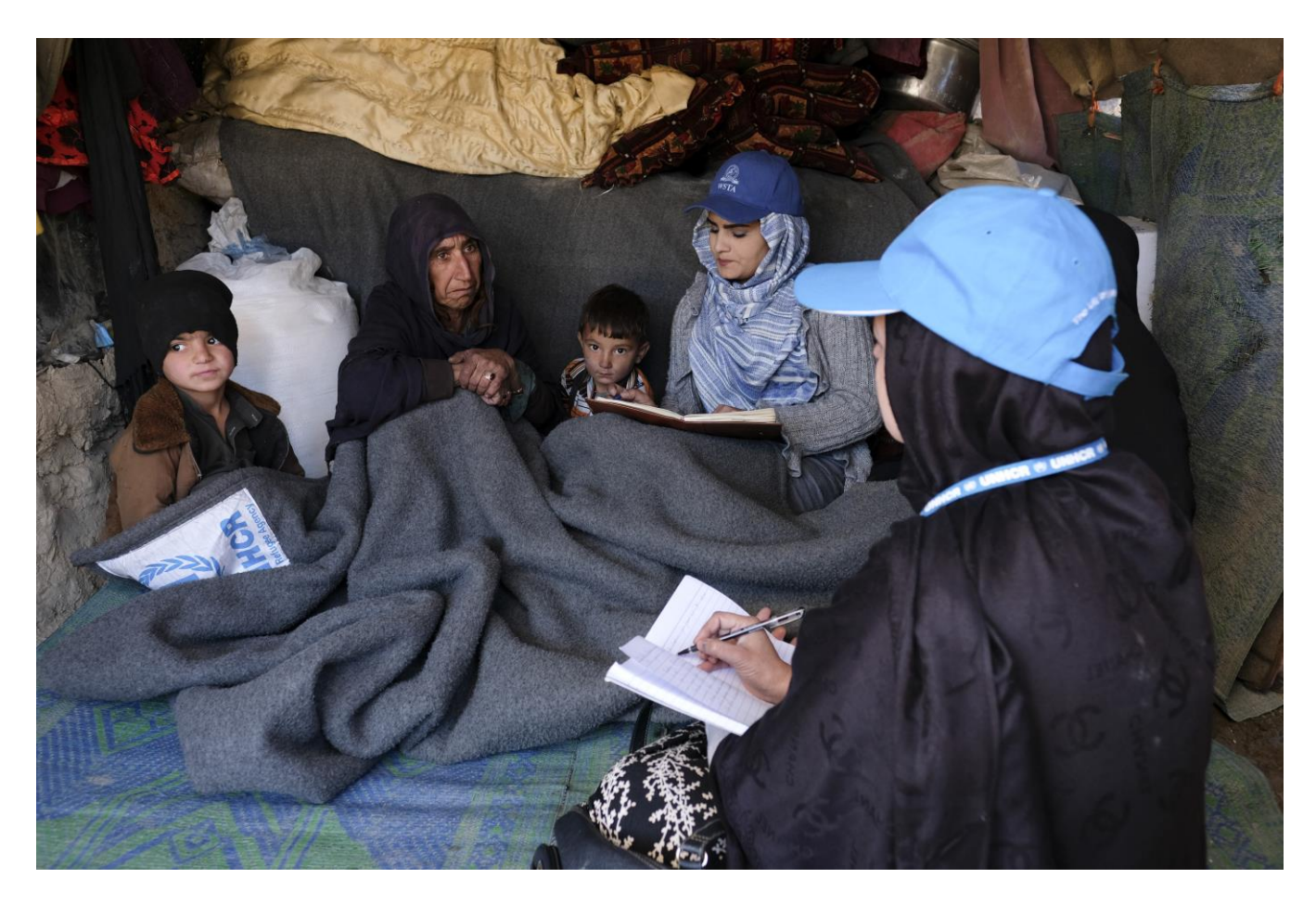
Community-based protection monitoring provides a basis on which to plan interventions for persons with specific needs and to strengthen community initiatives, while providing evidence for advocacy efforts.