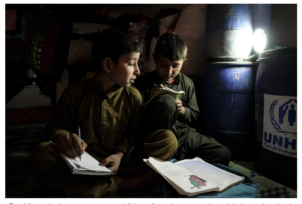
Providing solar lamps to returnee children allows them to study and do better in school.

Engage Government, partners and diverse stakeholders for sustainable solutions