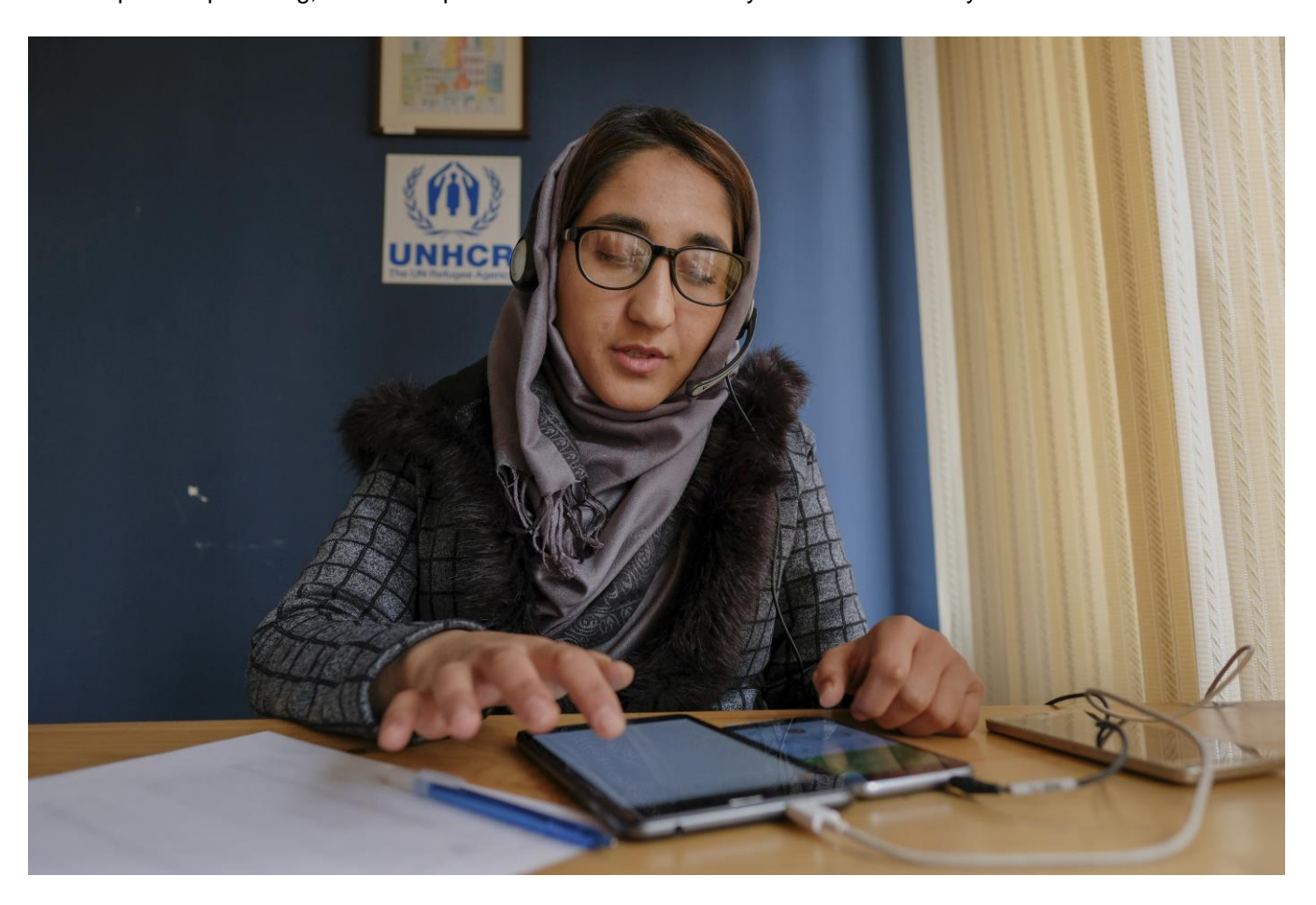
UNHCR systematically collects, verifies and analyses information over an extended period of time to assess the protection situation of IDPs, returnees and host communities in order to plan more effective responses.