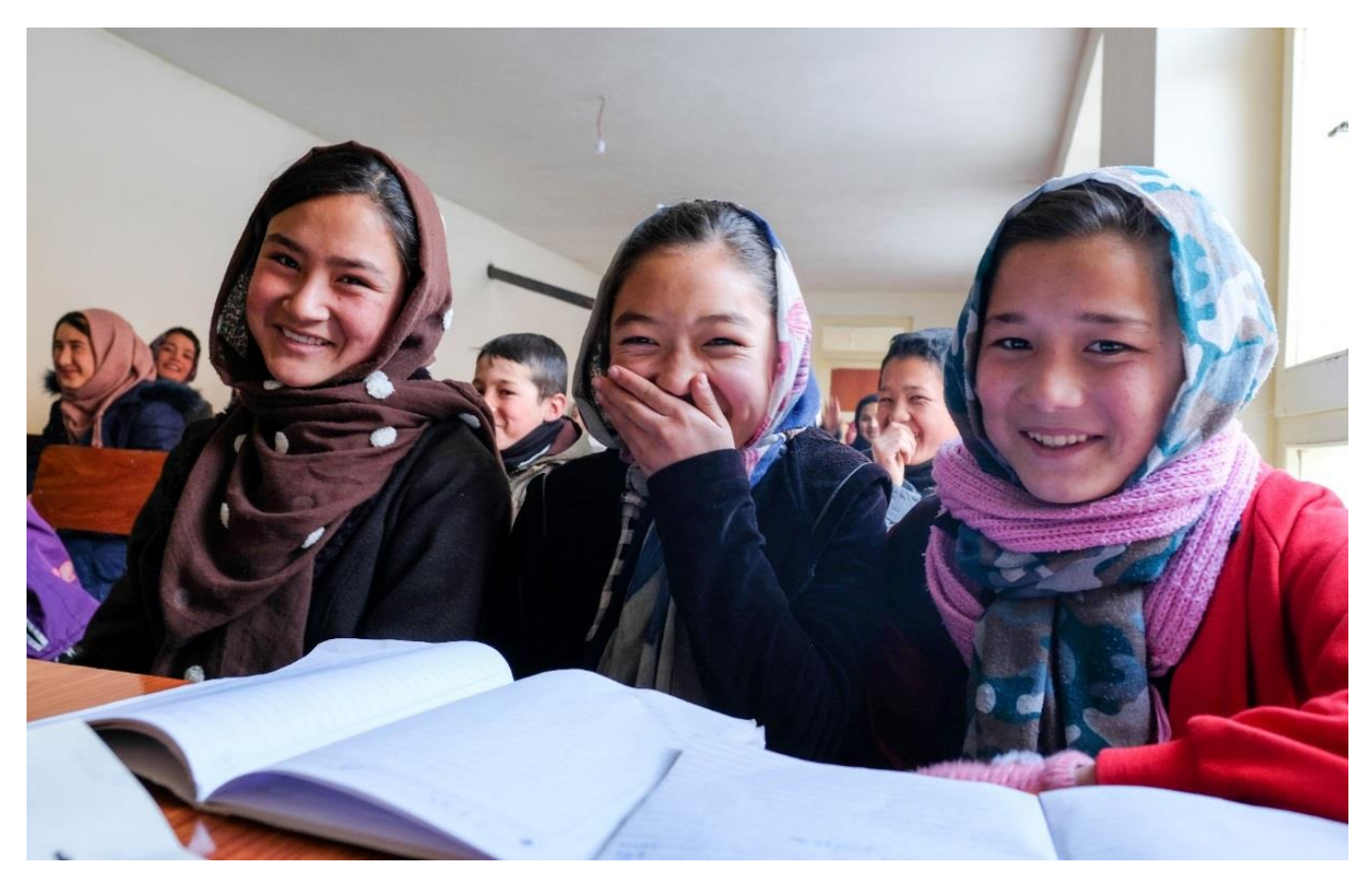
UNHCR community based protection measures: supporting access to education for children.

and NFIs) for persons with specific needs. UNHCR will continue to advocate for inclusion of the refugee population in national healthcare and education programmes, and will continue monitoring the situation and providing support to the Government and partners.